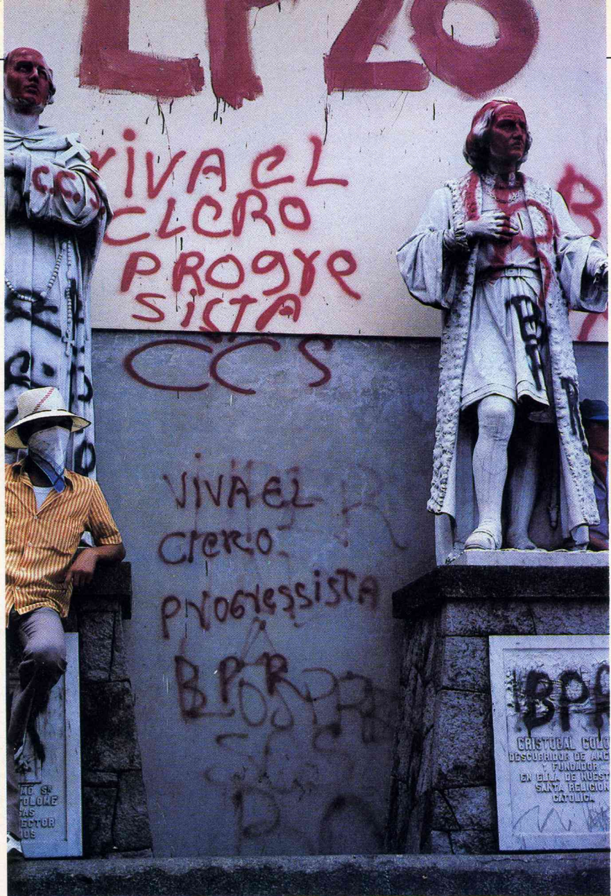
STATUE OF CHRISTOPHER COLUMBUS , right, in front of El Salvador church is besmirched by revolutionary graffiti. Slogan says "Long Live the Progressive Clergy." Priests have been in forefront of demands for radical change in Latin America.

country to be used as a staging area for Sandinista forces as well as being a major trafficker of arms for their cause.