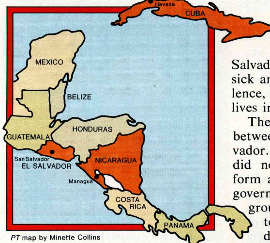
PT map by Minette Collins

sumed at first to encourage "moderates" within the Sandinista-dominated junta—has been stopped. This only permits the government to blame Washington for the economic mess. America is the "bad boy" once more.