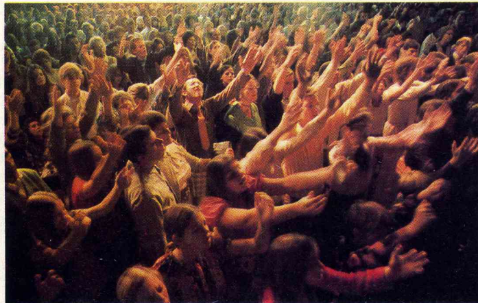
WITNESS AND TESTIMONY. In public displays of worship, many sincere people strive to draw closer to their God. Is this evidence of being “born-again”? Read this article to find out.

For some time now, large numbers of people have been rejecting the image of traditional Christianity. They see a world filled